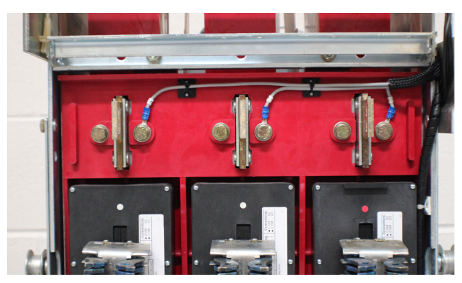
Line-side voltage connections on DS Breaker (Fingers Removed)