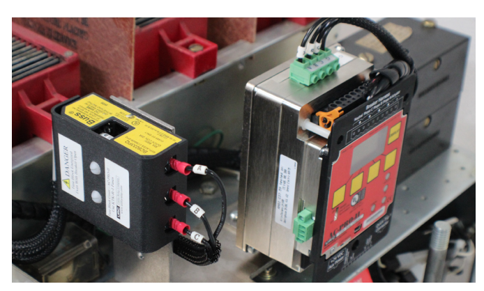
AC-PRO-II® with VDM and Fuse Block with cover on DS Breaker