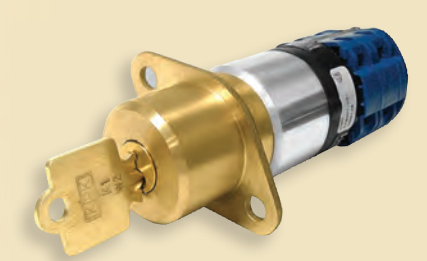
Kirk Key Type PPS Switch