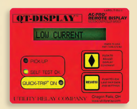
QUICK-TRIP Arc Flash Reduction

Combine KIRK® Interlock System with QUICK-TRIP Arc Flash Reduction