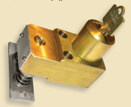
Kirk Key Type DC Door Lock Other Door Style Interlocks Available