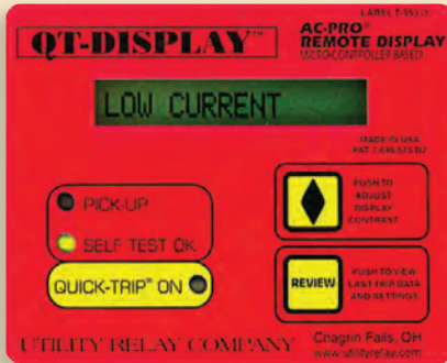
QUICK-TRIP Arc Flash Reduction

Combine KIRK® Interlock System with QUICK-TRIP Arc Flash Reduction