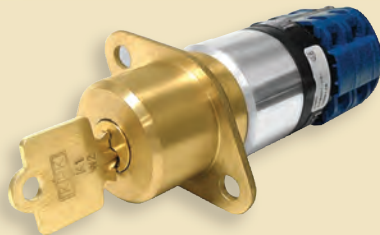
Kirk Key Type PPS Switch